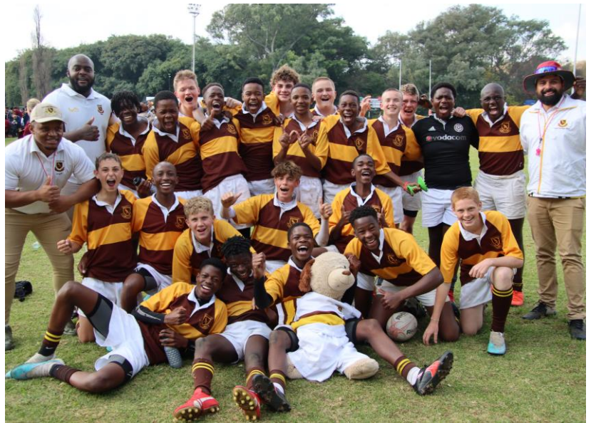
Congratulations to the U15 Rugby team who won their league at the Pirates Challenge according to log points.