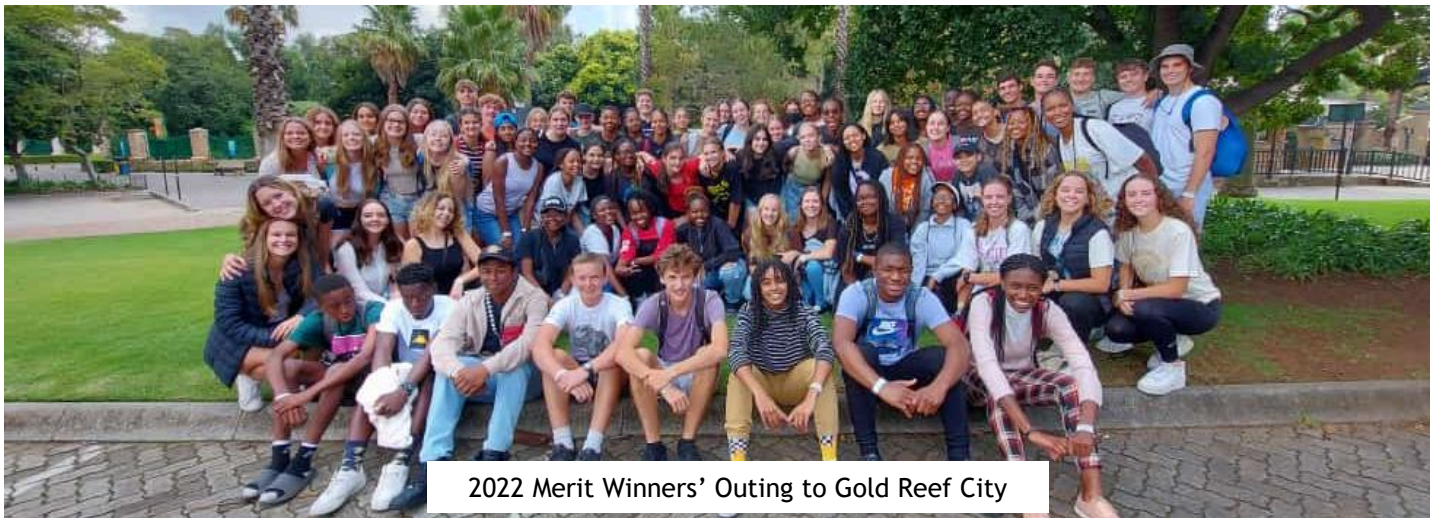
2022 Merit Winners' Outing to Gold Reef City

Grade 11s are required to hand in a copy of their ID cards to the Front Office once received from the Department of Home Affairs. The ID is required for Matric registration.